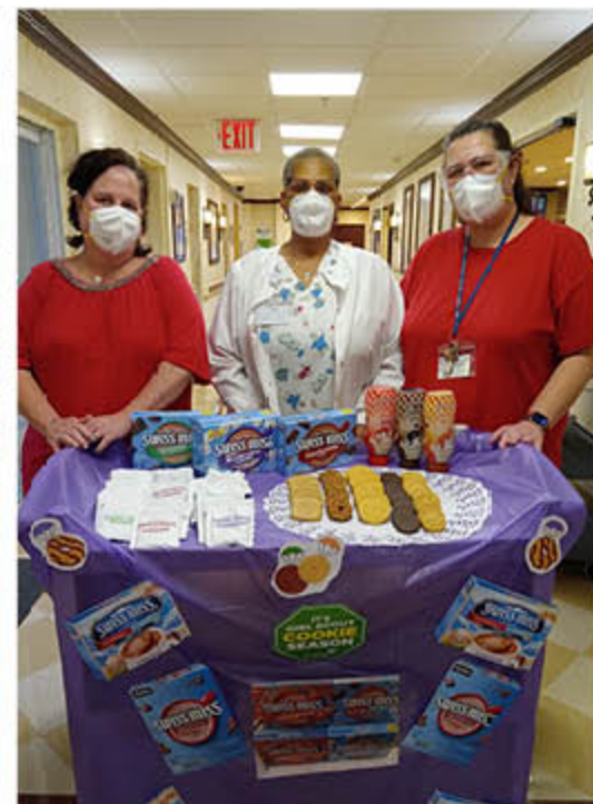
Sweet treat of Girl Scout Cookies and Swiss Miss