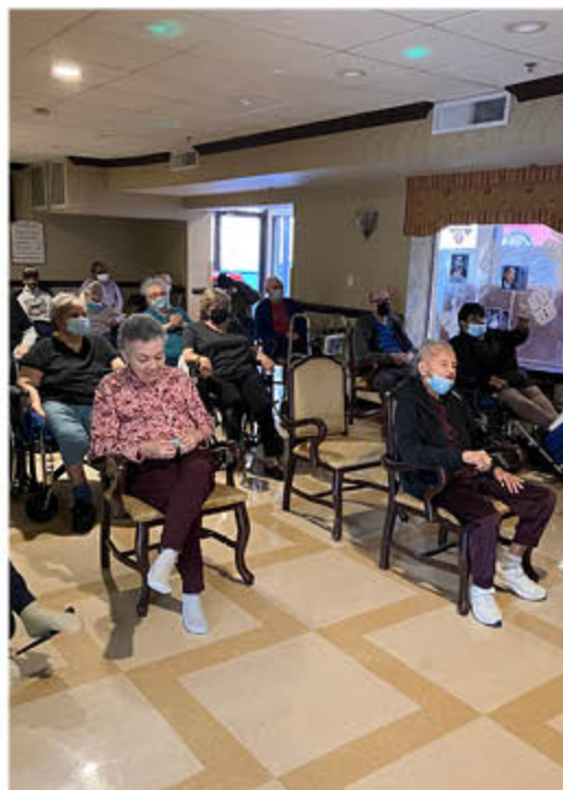
Residents enjoying entertainment